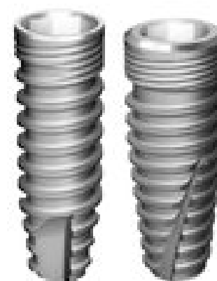
D3.7 D4.4 D5.1 D5.6