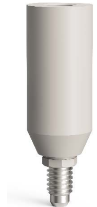
Scanbody , indexed Ref. No. 1801.00