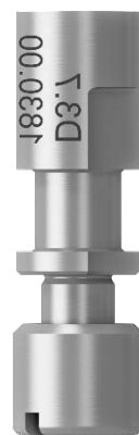
Ref. No. 1830.00

Manufactured only by LASAK LASAK_IMPLADENT_(one piece).zip